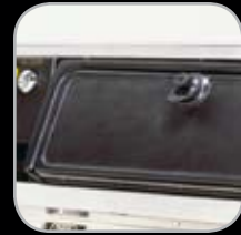
Locking Glove Box**