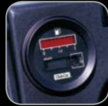
Fuel Gauge** and Hour Meter