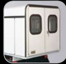
Custom Van Box