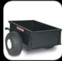
Swisher Dump Cart