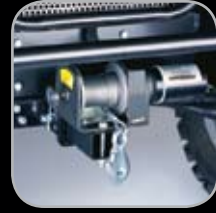
1,500 lb Winch