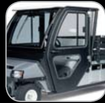
Certified ROPS Cab Enclosure