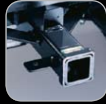
2-Inch Rear Receiver Hitch