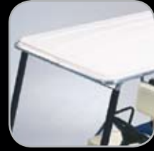
Canopy Top White***