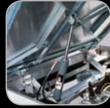
Hydraulic** and Electric Bed Lift